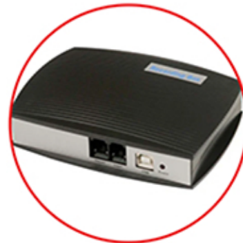
USB Voice Logger