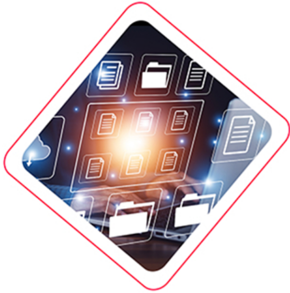
Data File Server

One Stop availability of the Data Storage and Centralised Access of Data with Active Directory.