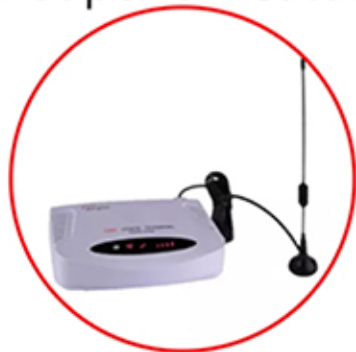
GSM FCT Products

We are engaged in offering a wide range of USB Voice Logger, GSM Call Recorder, PCI Voice Logger for analog lines and ISDN-E1 Voice Logger, VOIP for Digital Lines. For the convenience of our customers, installation and maintenance of these telecom products is done at cost-effective rates. These products are widely used by our corporate clients because of their superior features