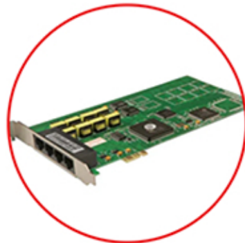
PCI Voice Logger